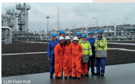
LLM Field Visit