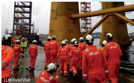
LLM Field Visit

For a detailed programme and time schedule visit: www.nselp.eu .