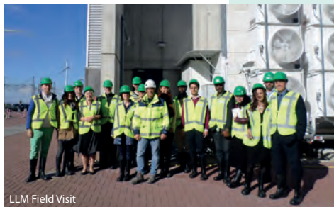
LLM Field Visit