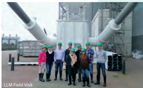
LLM Field Visit